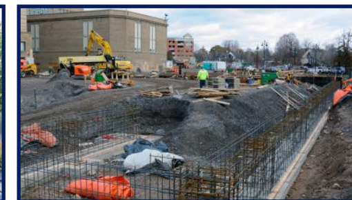
December 2017 Foundation work underway for new Physical Education addition (see page 1)

An evolving scene from the same perspective of the demolition of School 15 along Averill Ave.