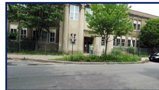
July 2017 Former front entrance